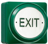
Push Plate DDA Button